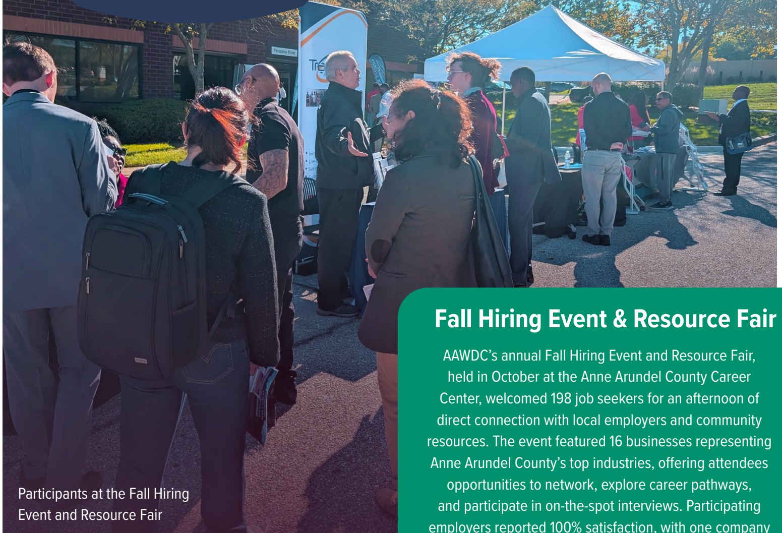
Participants at the Fall Hiring Event and Resource Fair